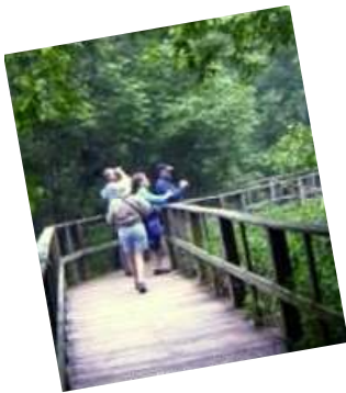
A half mile boardwalk makes a great birding trail.