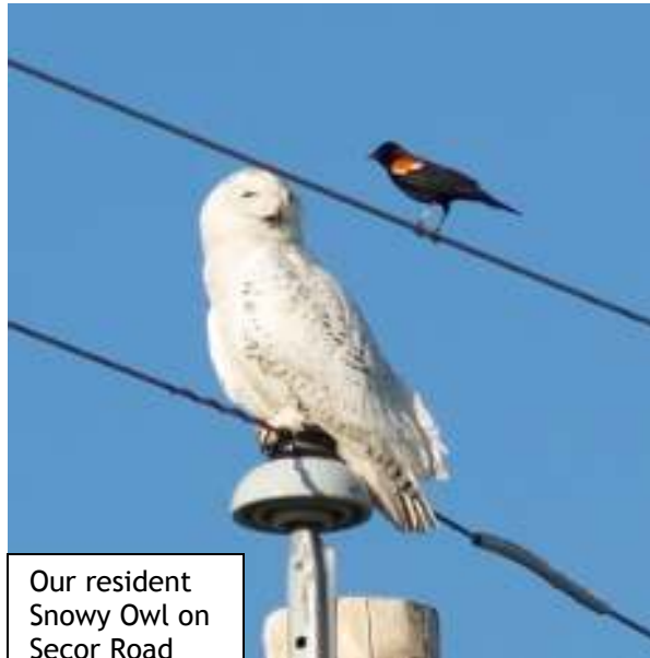
Our resident Snowy Owl on Secor Road

"I've never seen you here before. You're a what? A SNOWY Owl? I don't suppose then you will be making a reservation to fly south with us?"