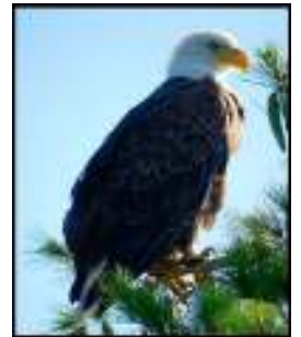
Bald Eagle by Gerri Erickson

Before going inside, I decided I'd fill the bird feeders and take one last look at Long Lake before nightfall. Overhead it flew, a mature Bald Eagle winging its way across the cove and out of sight. My good fortune was amazing, but still not quite over. With one foot on the step, I looked up and found that in the "Eagle pine", there was an oddly-plumaged huge bird staring down at me. Yes, believe it or not, it was another Eagle! This one was an immature that was mostly brown with a bit of splotchy white on the back of its neck. This is the first immature Eagle I have ever seen on our lake, so WOW, what a day it made!! These are the things my dreams are made of.