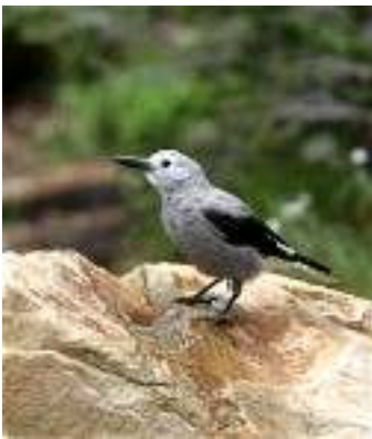
Clark's Nutcracker "One of our favorite birds on the Great Salt Lake trip"

Birds Unlimited Nature Shop donated three $25 gift certificates. Also thanks to Wildflowers of Glen Arbor for donating a ceramic bird feeder and some spring flowering bulbs.